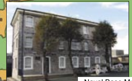
Naval Base Museum