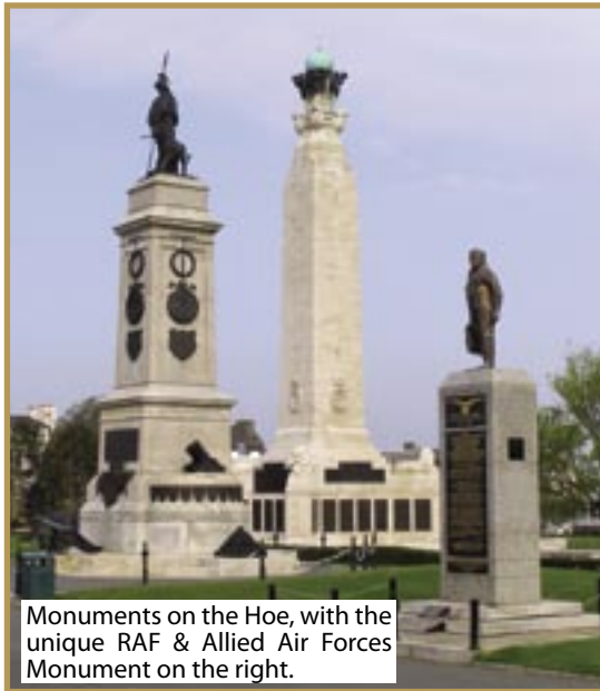
Monuments on the Hoe, with the unique RAF & Allied Air Forces Monument on the right.