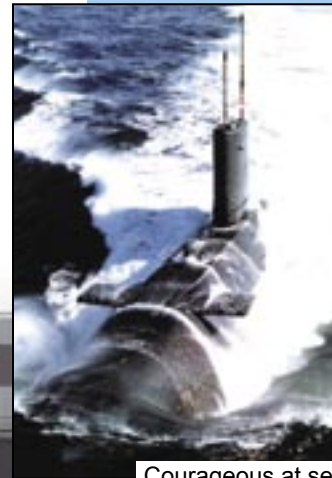
Courageous at sea