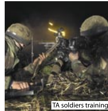
TA soldiers training

In April 2008 TA 100 was launched as a year of celebration to mark the contribution of Territorial Soldiers past and present across a century of service. The Territorial Army (TA) today plays a role as critical to overall military effectiveness as at any point in its history. Indeed, it is difficult to imagine how the Regular Army could meet its present commitments without the combat capacity and professional support provided by Territorial soldiers. TA soldiers are trained, equipped and