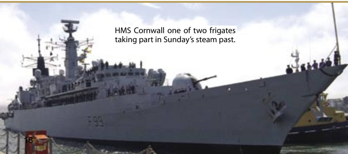
HMS Cornwall one of two frigates taking part in Sunday's steam past.