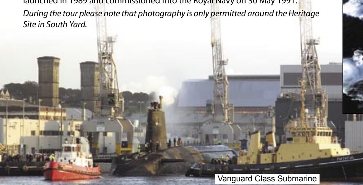
Vanguard Class Submarine