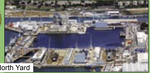
5 Basin, North Yard