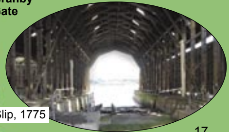
No 1 Covered Slip, 1775