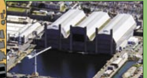
The Frigate Refit Complex