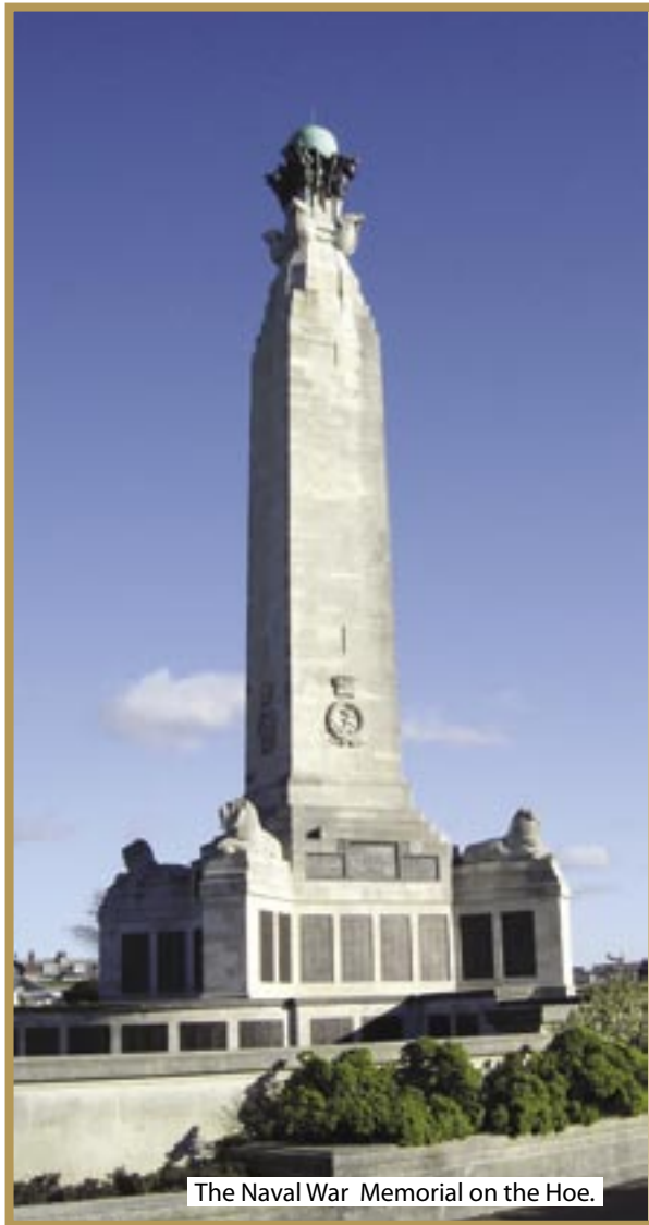
The Naval War Memorial on the Hoe.