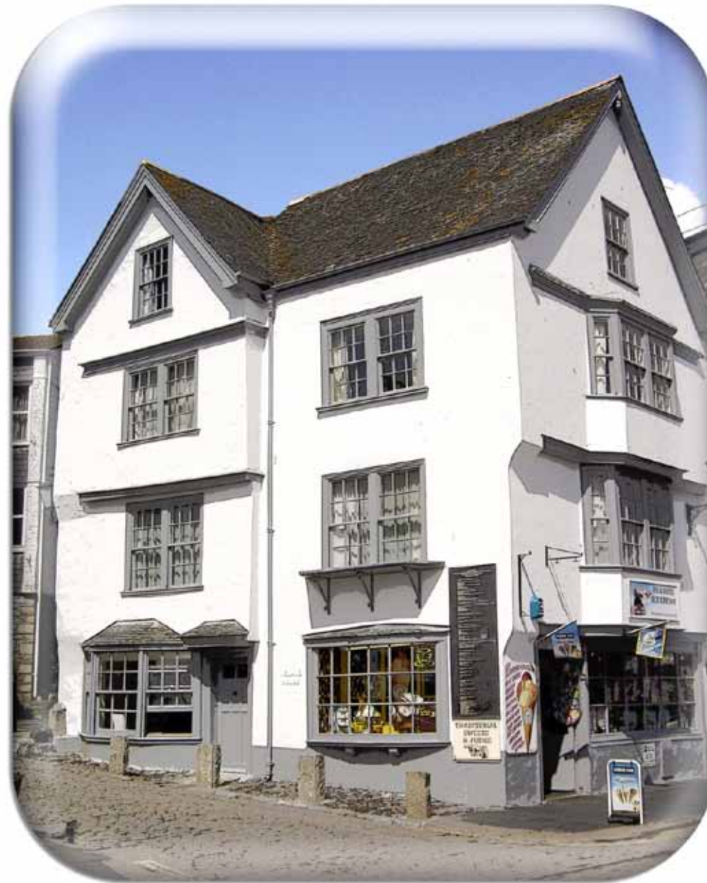
Island House, The Barbican