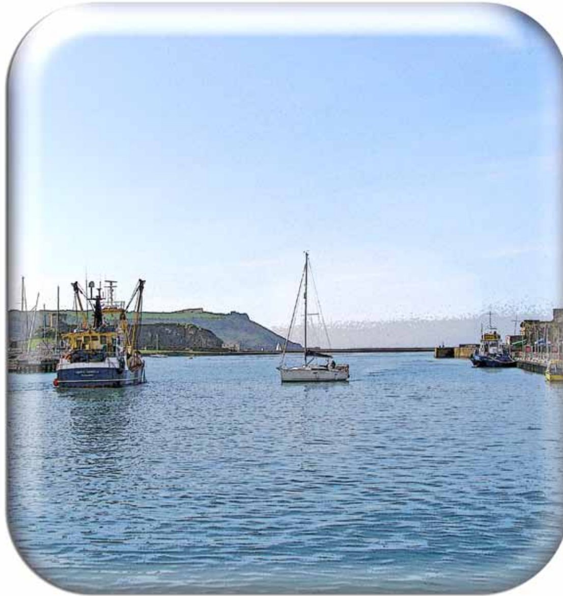
Heading out to Plymouth Sound