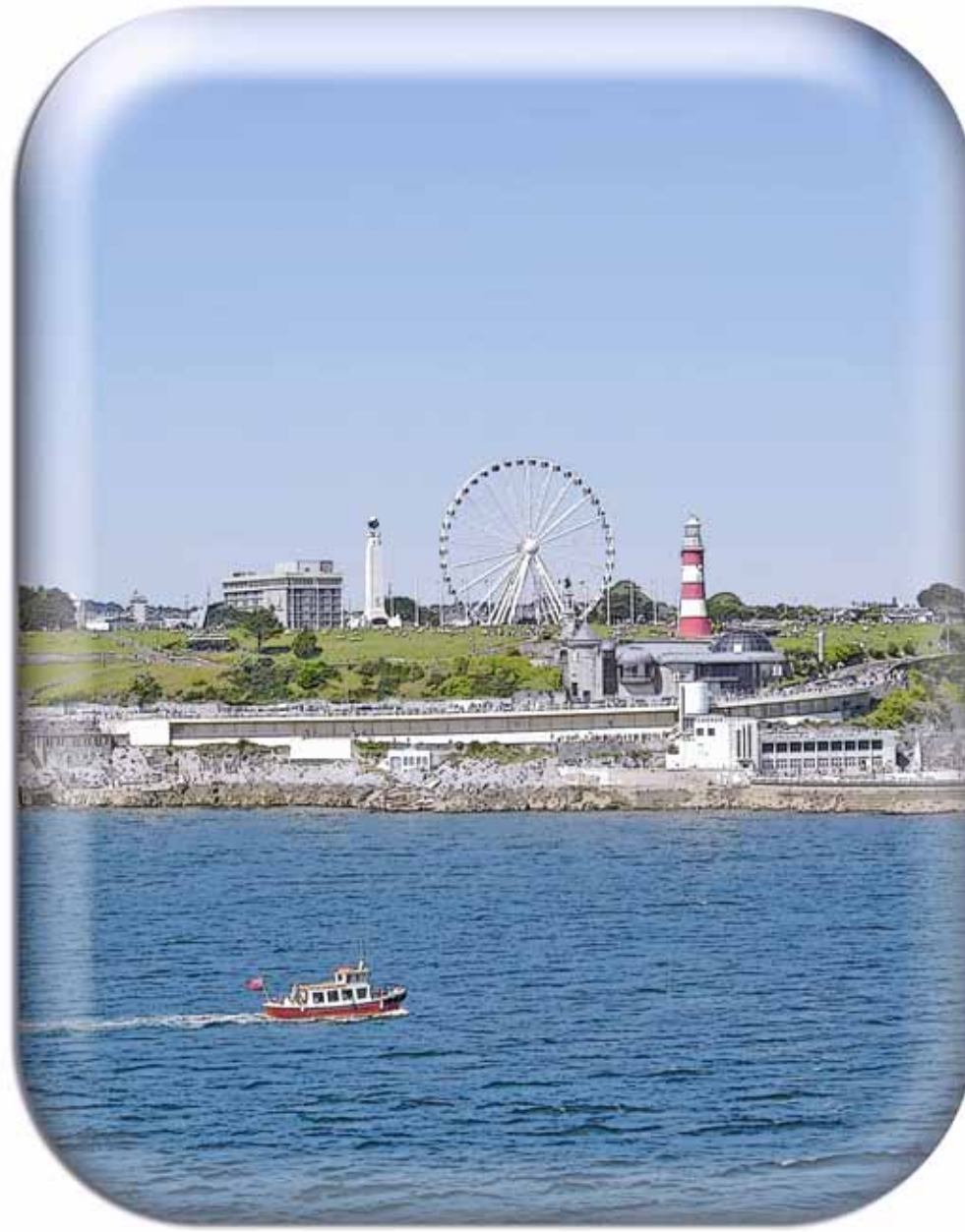
Smeaton's Tower and the Hoe